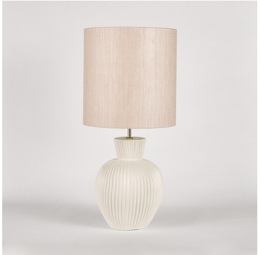
TL160 in Chalk and Polished Brass with 13" Tall Drum in James Hare Vyne Silk Rose Quartz 31625/13

IEC (International Electrotechnical Commission) test certificates available - will incur a surcharge UL (Underwriters Laboratories) test certificates available for the USA - will incur a surcharge Suitable for Yachts - Rod and bolting available for use on yachts