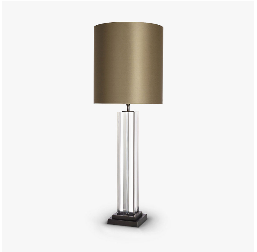
TL289 in Clear and Bronze with a 11" Tall Drum in Silk Crepe Satin 1806W-310 Timber Wolf