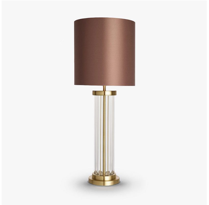
TL291 in Clear and Polished Gold with 11" Tall Drum in Silk Crepe Satin 1806W-26 Nutmeg