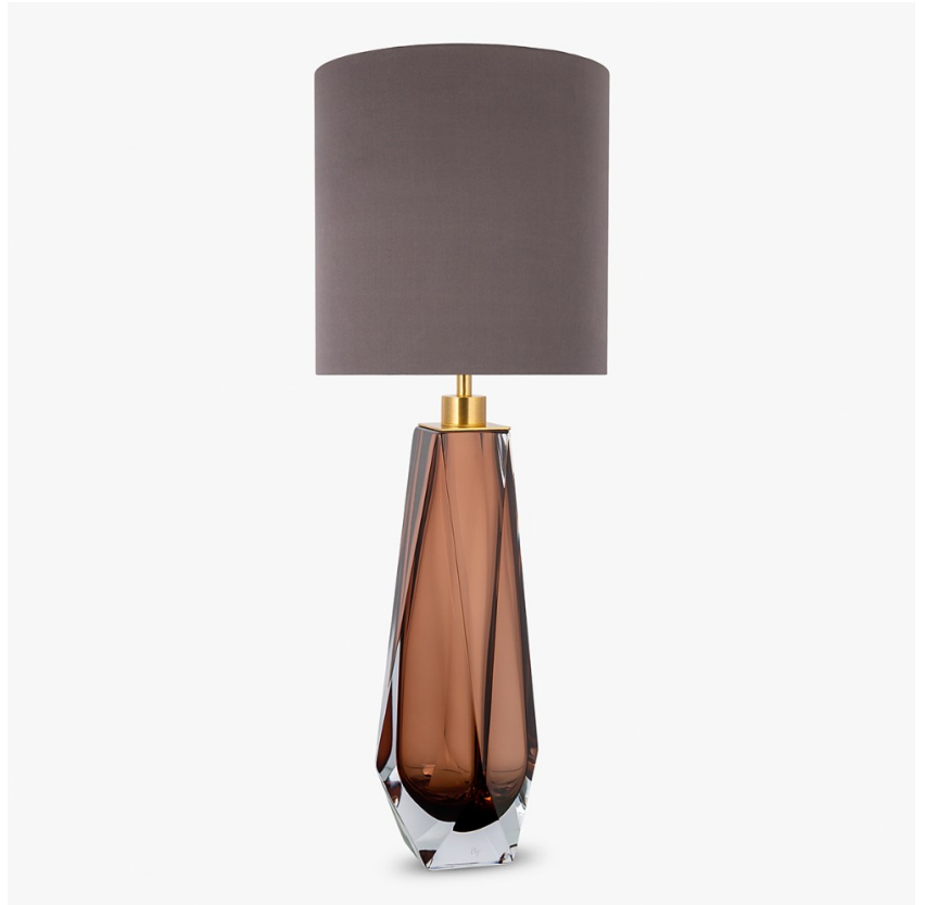
TL702 in Tobacco & Clear Murano Glass and Brushed Gold with 11" Tall Drum Shade in Bennett's Dupion Silk 5018W/ 86