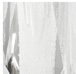
Diamond Clear Soda Glass