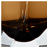
Tobacco & Clear