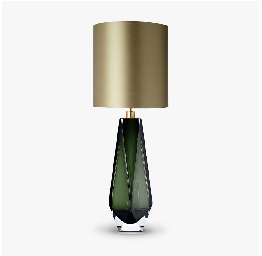
TL703-XL in Forest Green and Clear Murano Glass with a 13" Tall Drum Shade in 1806W/ Timber Wolf