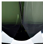
Forest Green & Clear