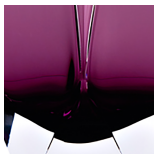
Amethyst & Clear