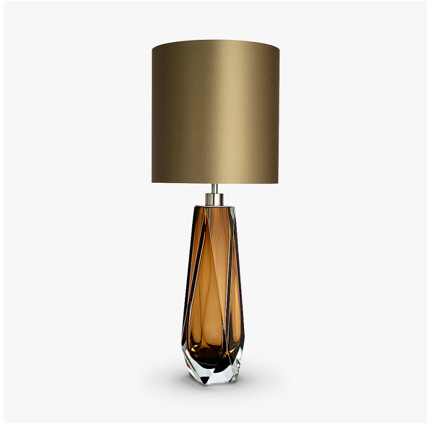
TL703-XL in Tobacco & Clear and Brushed Nickel with a 13" Tall Drum Shade Bennett Silks Crepe Satin 1806W-310 Timber Wolf