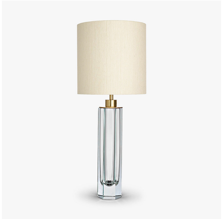
TL704-SM in Clear Murano Glass with Brushed Gold and 10" Tall Drum Shade in Bennett's Silk Linen 3998W