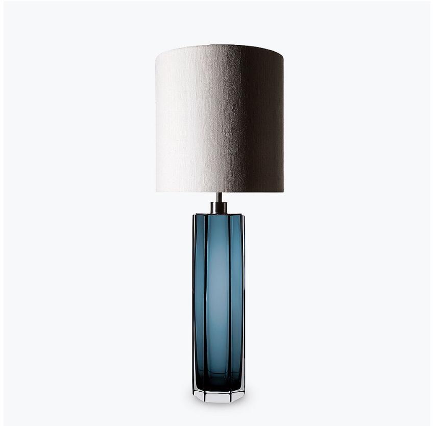
TL704-LA in Petrol Blue and Clear with a Brushed Nickel Top and a 12" Tall Drum Shade in Silk Linen 3998/ W White