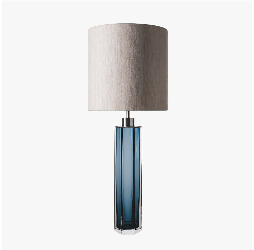
TL704-SM in Slate & Clear with Brushed Nickel and 10" Tall Drum in 3998W