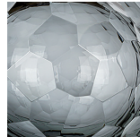
Round Petrol Blue & Clear