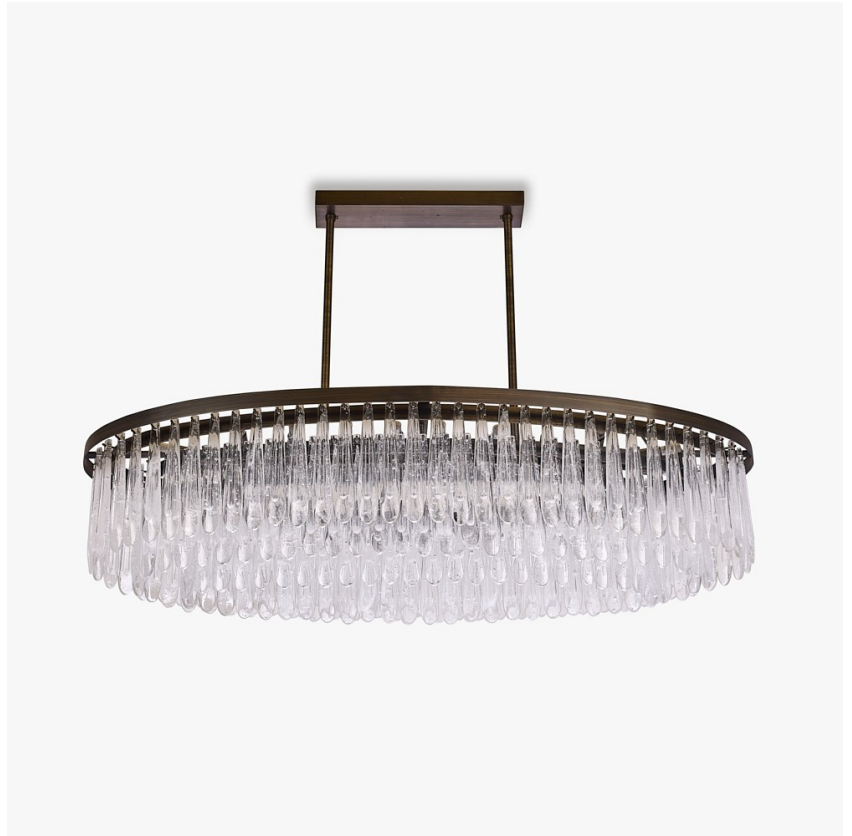
CL463-3T-O-120 in Clear Scallop Glass and Brushed Bronze