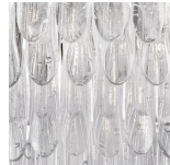
Clear Scallop Glass