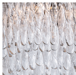
Clear Ribbon Glass