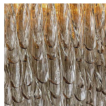
Clear & Smoke Ribbon Glass