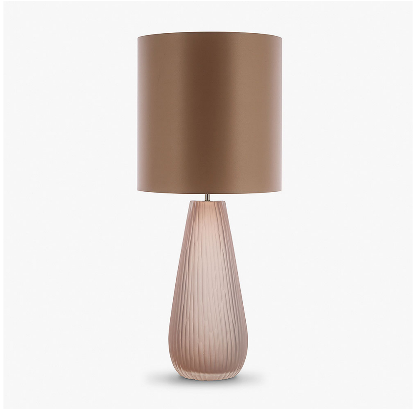
TL237 in Blush Pink Glass and Brushed Nickel with a 12" Tall Drum Shade in 1806W-306 Marsalla