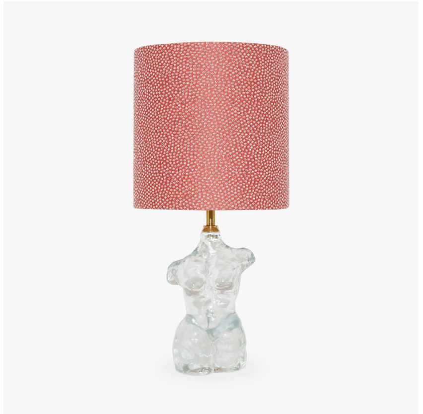
TL814 in Clear Glass and Polished Brass with 9" Tall Drum Shade in James Hare Shagreen Coral 31537-24