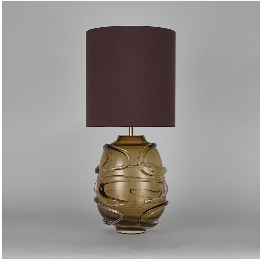
TL861 in Cacao and Brushed Gold with 12" Tall Drum in Bennett's 5018W-127 Raisin